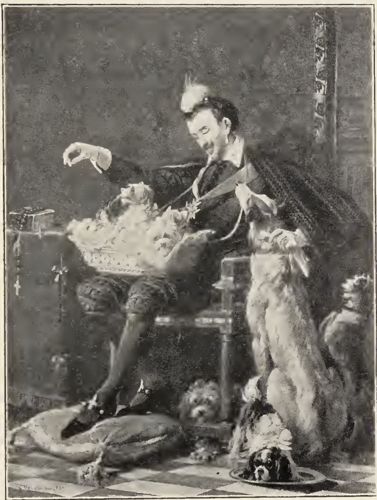
KING HENRY III.

After the painting by Ch. Herrmann-Léon. (Modern painting, using Clouet's portrait of the King as guide and copy.)